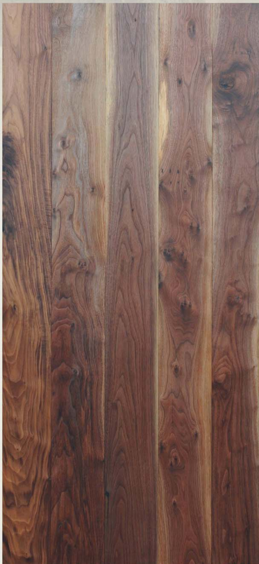
SH-2-1-02, solid plank, 18x150x1820mm character, oiled, natural, smooth