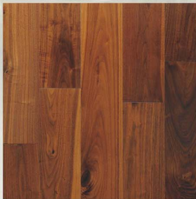
FHS-1-1-07J, engineered w/ sliced face 2.0mm 15x150x310mm & up, Character, UV coating natural, hand-sculpted