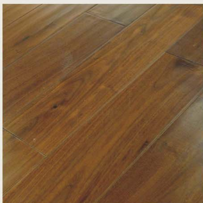
FHS-1-1-05J, engineered w/ sliced face 2.0mm 15x130x310mm & up, character, UV coating natural, hand-sculpted