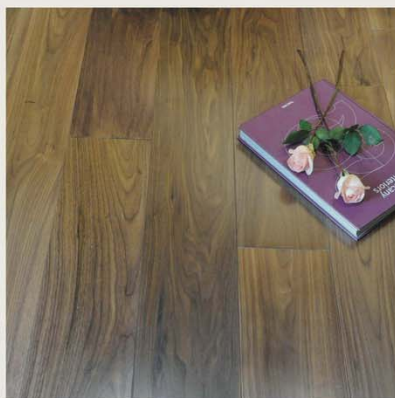
SH-1-1-03J, solid plank, 22x165x310mm & up Sel & btr, UV coating, natural, smooth